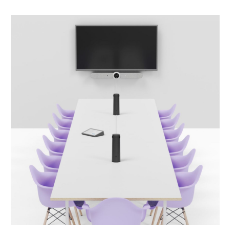
Extra-Large Rooms & "Challenge" Rooms

A single Sight can alleviate some camera inequity in rooms with 10+ seats, or rooms with a particularly challenging layout.